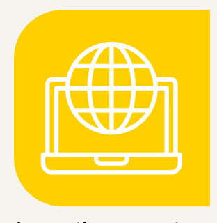
Innovation ecosystem and networking

The EDIH Network's unique advantage lies in its Europe-wide pool of expertise coupled with its local presence. This enables us to effectively communicate with businesses in their respective languages and possess extensive knowledge of both local and EU matters, policies, and sectors.